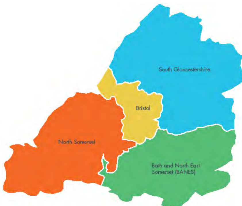
West of England Area Map Outline

Wesport has an excellent track record in its ten year history, changing perceptions, enabling delivery and bringing additional resources (over £9m) for sport and physical activity into the West of England. This track record will stand Wesport in good stead as it starts on the next ambitious stage of its growth and development.