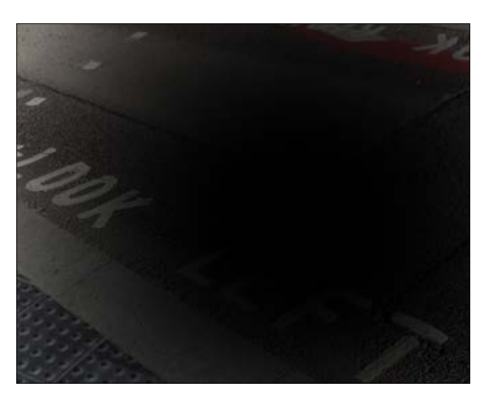
Age-related Macular Degeneration (AMD)