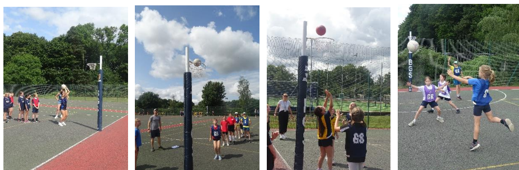
Action from the 'World Cup' Festival (North) hosted at BGS Sports-ground in Failand.

8 Schools attended – Haywood Village, Grove, Golden Valley, Burrington, Portishead, Backwell, Wrington and Crockerne. 70 participants – 62 girls and 8 boys.