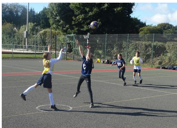
Action from the 'Stingers' Bee Netball 'Give it a Try' Festival