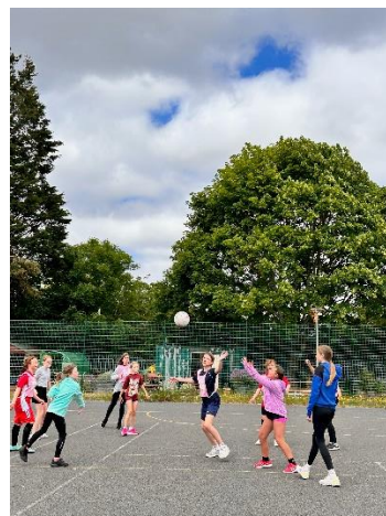
Action from across the 3 FREE Netball camps held over June half-term.